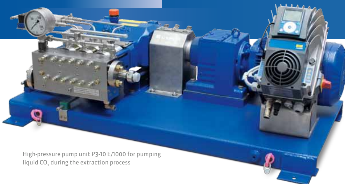
High-pressure pump unit P3-10 E/1000 for pumping liquid CO 2 during the extraction process