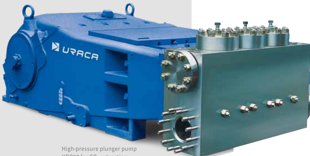
High-pressure plunger pump KD827 for CO 2 extraction