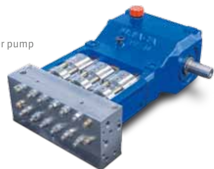
High-pressure plunger pump P3-10 for liquid CO 2